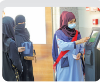
ELECTRONIC QUEUE MGMT. SYSTEM