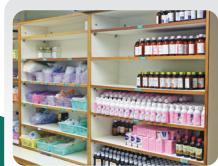
WELL STOCKED PHARMACY

ChildLife provides life-saving treatment to millions of children annually – free of cost. It manages 24/7 Children Emergency Rooms & Telemedicine Satellite Centers in public sector hospitals across Pakistan, in partnership with the government.