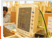
LIFE SAVING EQUIPMENT