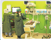
ADD 100 TRAINED STAFF/ER