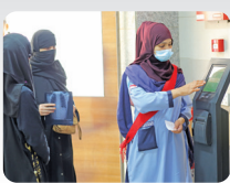
ELECTRONIC QUEUE MGMT. SYSTEM