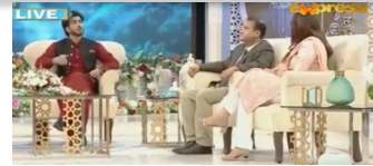
ChildLife was invited on Express TV during Ramadan